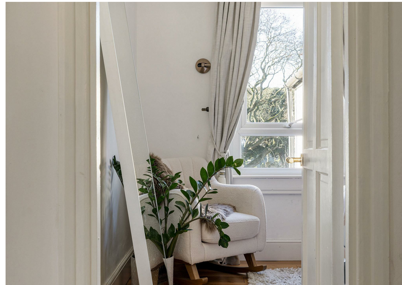
Reception Room 10'11" x 10'5"